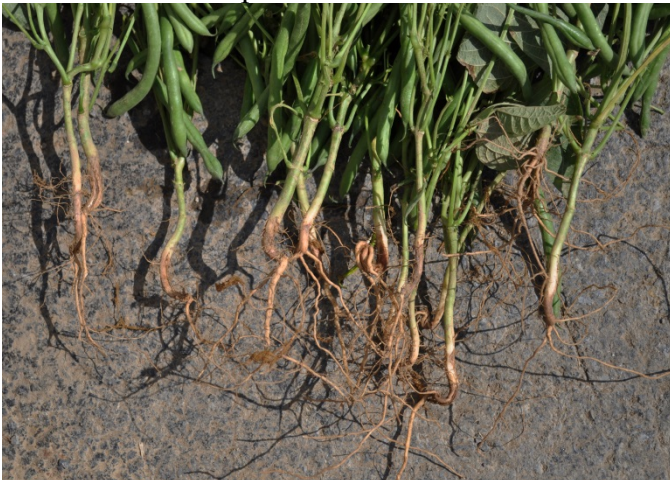
Figure 3. Bean roots used for health ratings. Each picture represents plants taken from one plot from each treatment.