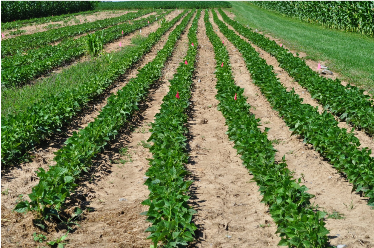
Figure 2. Field plots designated by different colored flags placed throughout the field. Note the inconsistent planting in the top of the picture.

determined that there was a mechanical problem with the planter that interfered with correct planting (seed placement). Because of the timing of compost application and plantings of adjacent fields there was no option to relocate to another field and replant for the 2015 season. A decision was made to continue emergence data collection on 2 subsequent dates and to do a root health rating on plants in the left-most rows only. Because of the obvious planter issues, yield assessments were not able to be completed this year.